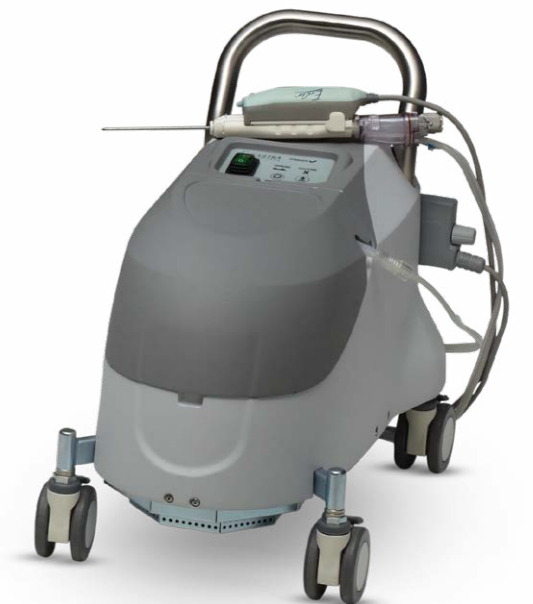
EnCor Enspire™ Breast Biopsy System

The compact EnCor Ultra™ Breast Biopsy System is easy to place within your workflow – with or without its space-saving procedure tray.