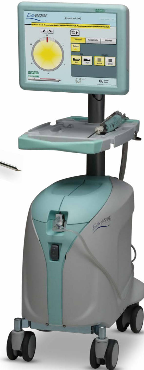
EnCor Enspire™ Breast Biopsy System